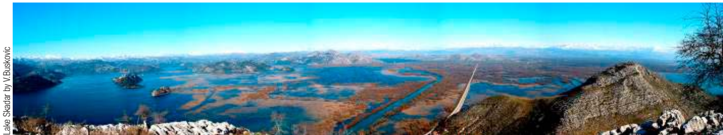
Lake Skadar by V. Buisukovic

Financing nature conservation and environmental protection in the region of South Eastern Europe is becoming an issue of growing importance. Public awareness on adverse effects of human activities on biodiversity and their negative impacts on ecosystems and the services they provide to society is increasing. Furthermore, the process of accession of the countries of the Western Balkans to the European Union is obliging continuous investments in environmental protection and nature conservation. As a result of these processes, funding for nature conservation and environmental protection today strongly depends on the public sector – national and local governments, multilateral and bilateral donors, European funds and international financing institutions and foundations. However, financing environmental sector and especially nature and biodiversity protection is in strong competition for funding with other national priorities and the lack of financial resources is often presented as a major obstacle for the good functioning of civil society organisations (CSOs) and institutions working in this area.