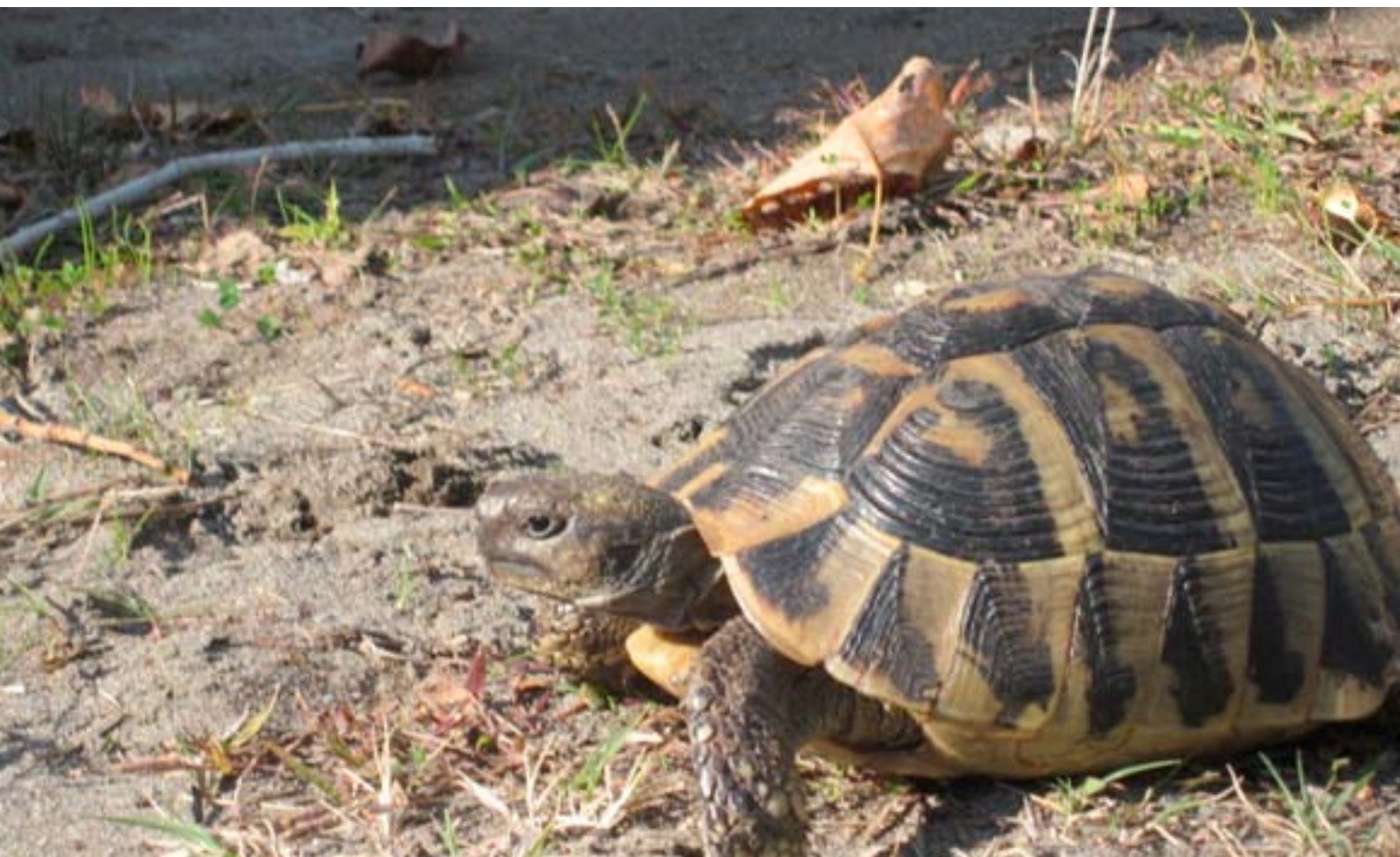
Testudo hermanni